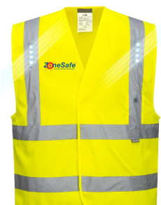
Optional Hi Viz Vest